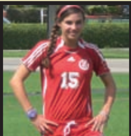
Sports FRENCH OPEN BERTHS